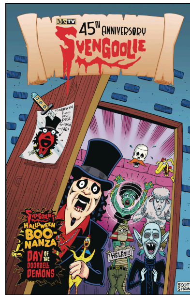
COVER B SCOTT SHAW ( AUG241780E , $7.99)